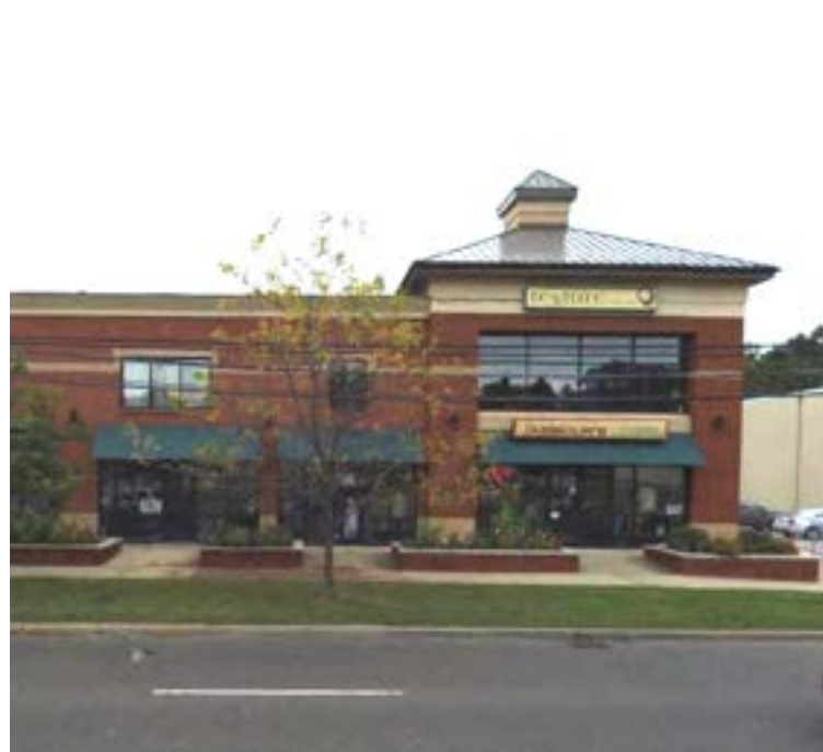
MIXED - USE