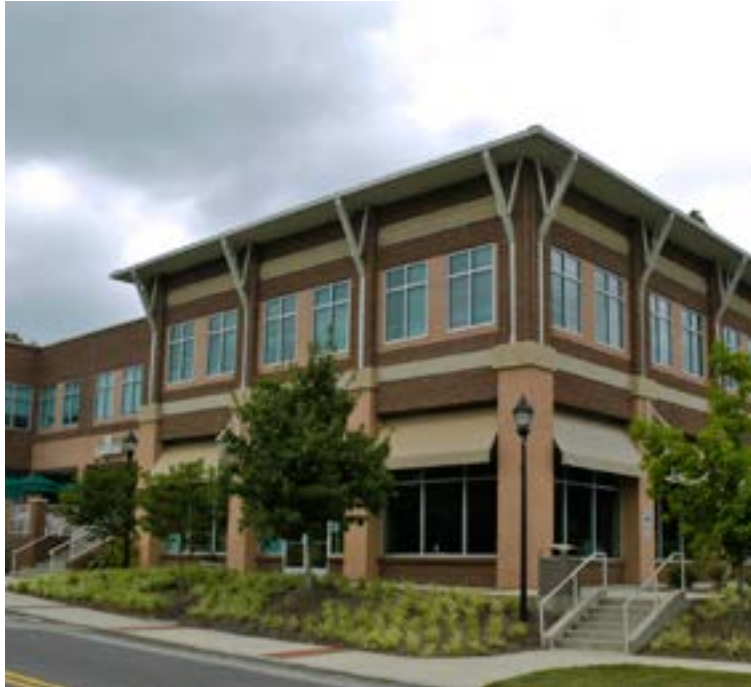
MIXED - USE