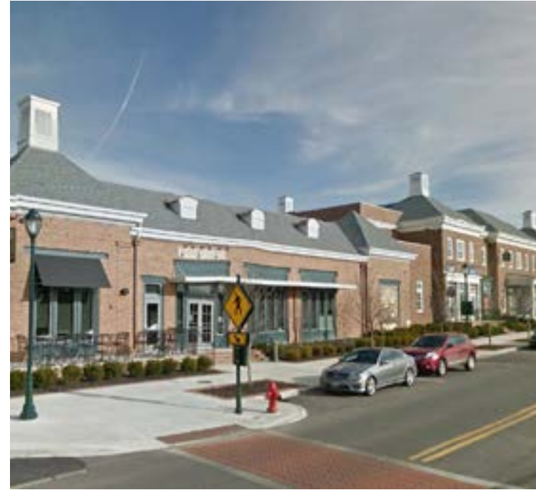
MIXED - USE