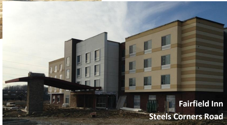
Fairfield Inn Steels Corners Road