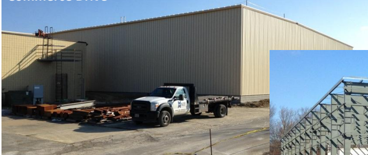
Walter Metals Expansion Commerce Drive